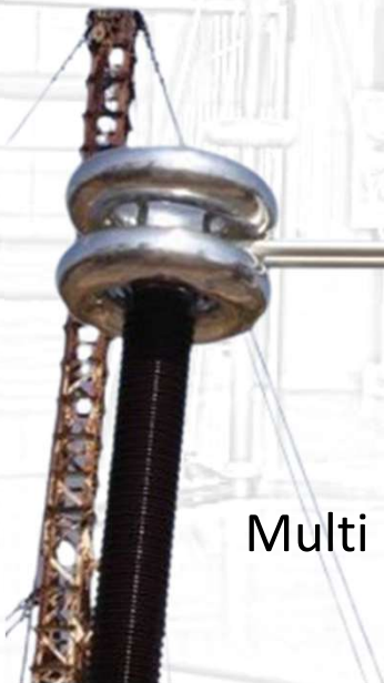
Multi Disc Corona Shield